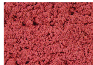
Food dye granulated powder