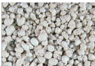
Topsin granulated powder