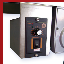
VARIABLE SPEED CONTROL BOX