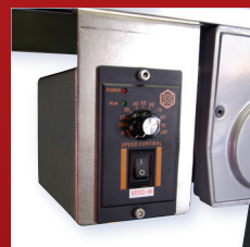
VARIABLE SPEED CONTROL BOX